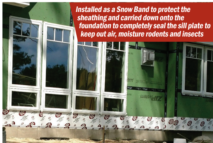
Installed as a Snow Band to protect the sheathing and carried down onto the foundation to completely seal the sill plate to keep out air, moisture rodents and insects

NOTE: For the most current information, refer to the Protecto Wrap website at www.protectowrap.com .