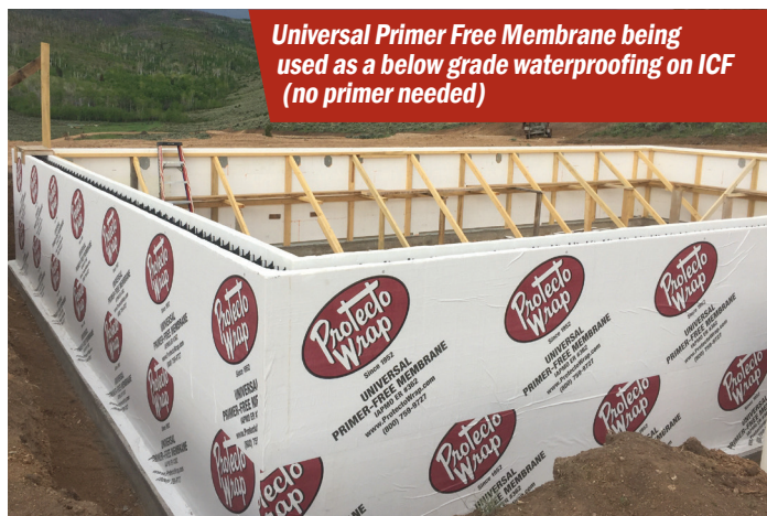
Universal Primer Free Membrane being used as a below grade waterproofing on ICF (no primer needed)