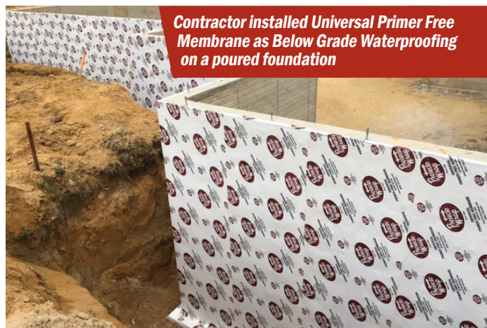
Contractor installed Universal Primer Free Membrane as Below Grade Waterproofing on a poured foundation