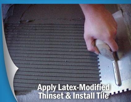
Apply Latex-Modified Thinset & Install Tile