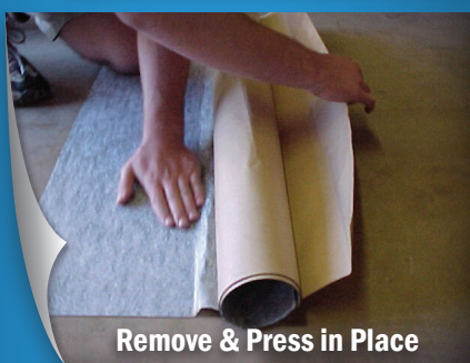
Remove & Press in Place