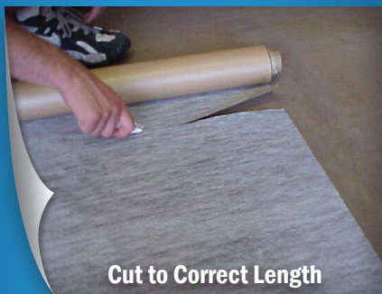
Cut to Correct Length