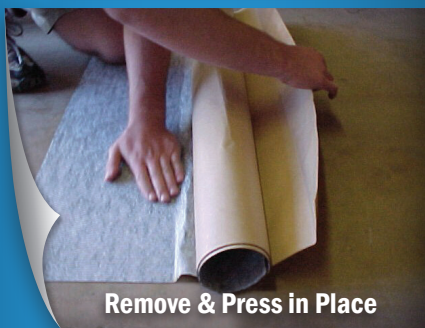
Remove & Press in Place