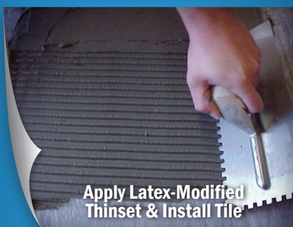
Apply Latex-Modified Thinset & Install Tile