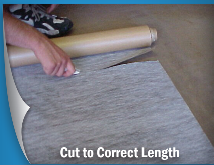
Cut to Correct Length