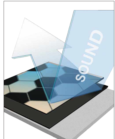
WhisperMat-CS reduces sound transmission through floors.