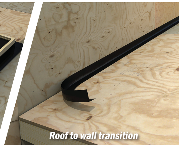
Roof to wall transition