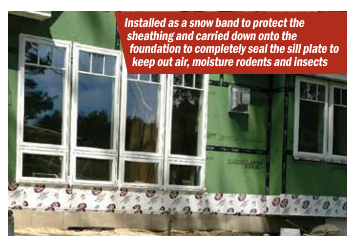
NOTE: For the most current information, refer to the Protecto Wrap website at www.protectowrap.com.