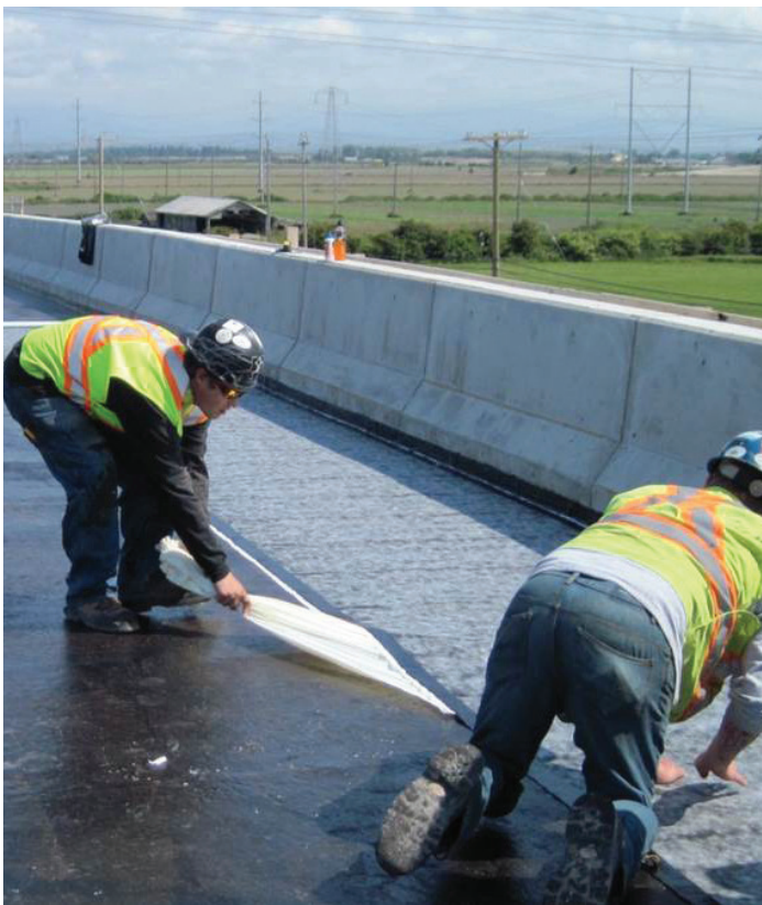
Release film removes easily after positioning membrane on overlap.