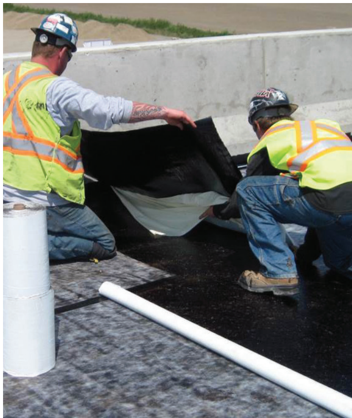
Silicone coated release film on the bottom allows the membrane to be easily positioned on the deck.