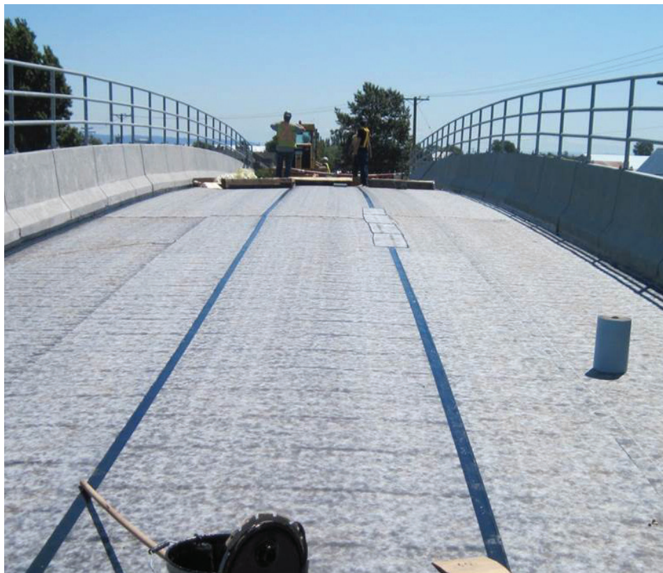
M-400A(R) rolls provide unique salvage edge (black SBS adhesive top) ensuring all roll laps are mastic to mastic cohesive bond for fully monolithic deck result.

When covering the membrane with asphaltic concrete mix, maximum aggregate size for M-400A should not exceed 3/8". Asphaltic application temperature should range between 275°F minimum and 300°F maximum at the time of application to the membrane.