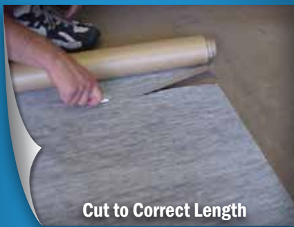
Cut to Correct Length