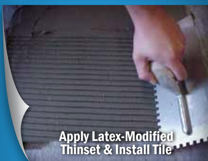
Apply Latex-Modified Thinset & Install Tile