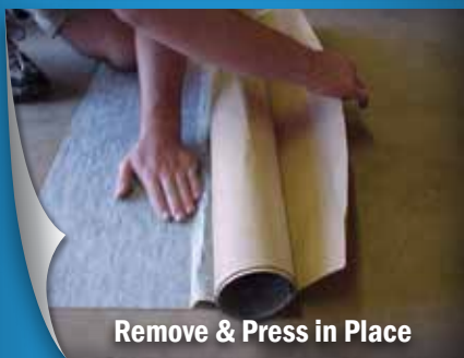
Remove & Press in Place