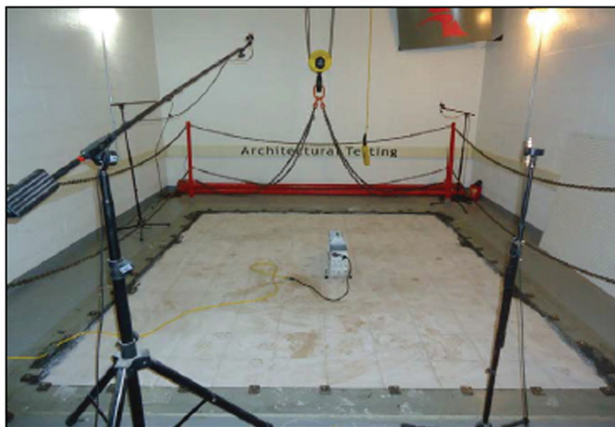
Source Room View of Test Specimen Installation