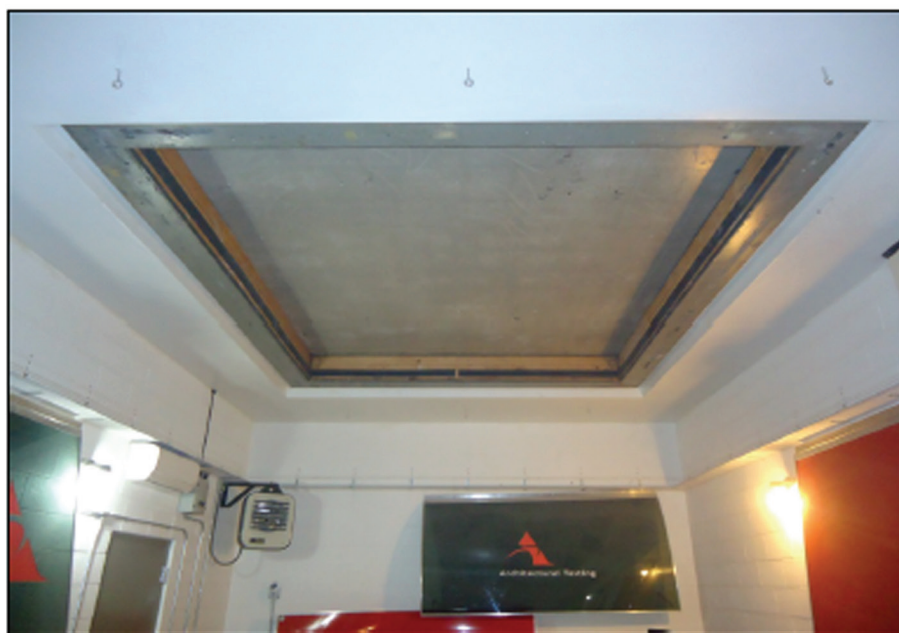
Receive Room View of Test Specimen Installation