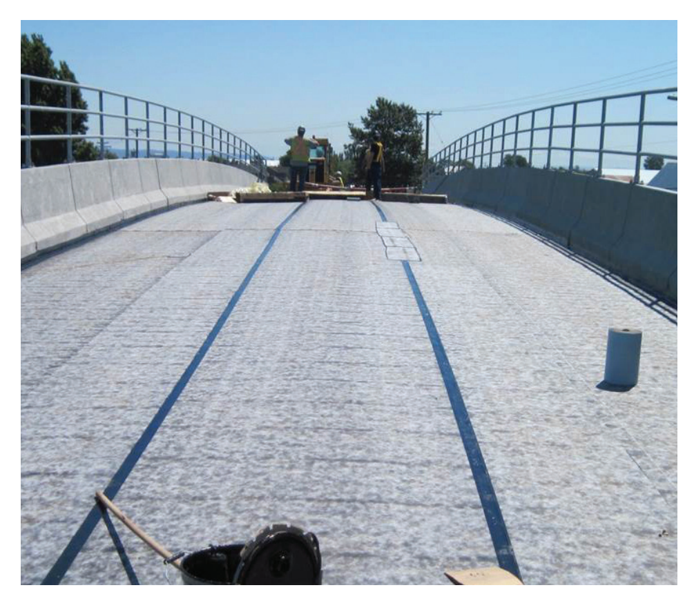
M-400A(R) rolls provide unique salvage edge (black SBS adhesive top) ensuring all roll laps are mastic to mastic cohesive bond for fully monolithic deck result.