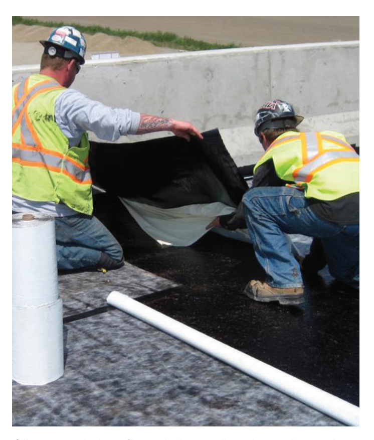
Silicone coated release film on the bottom allows the membrane to be easily positioned on the deck.