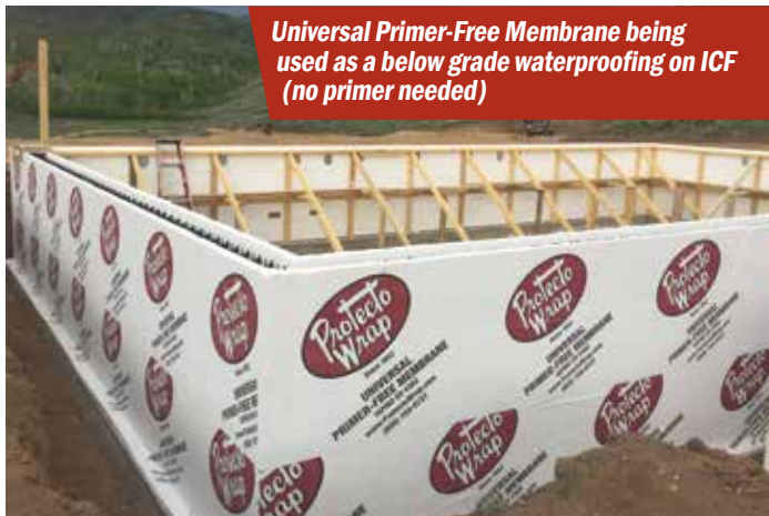
Universal Primer-Free Membrane being used as a below grade waterproofing on ICF (no primer needed)

4", 6", 9", 12", 18", 24", 36", 48" x 50'