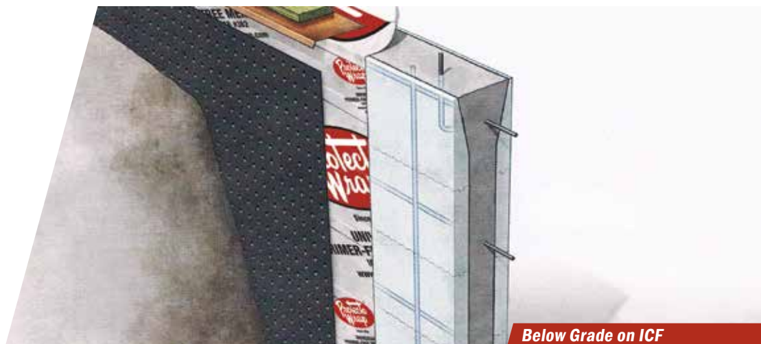
Below Grade on ICF

NEW! INSTALL DOWN TO -20°F (-28°C) WITHOUT THE NEED FOR A PRIMER