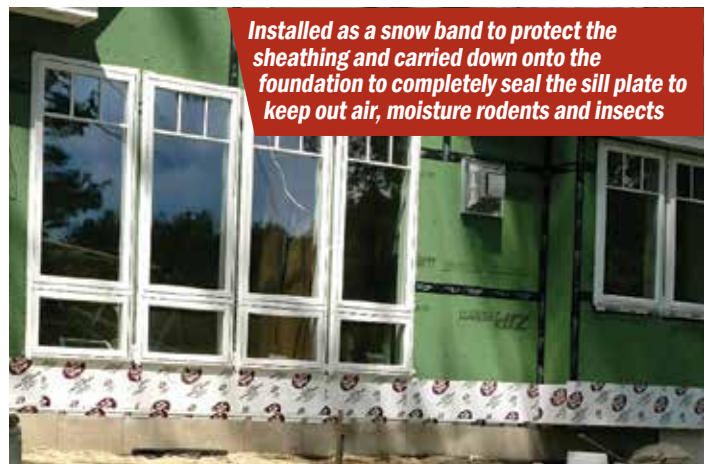
Installed as a snow band to protect the sheathing and carried down onto the foundation to completely seal the sill plate to keep out air, moisture rodents and insects

NOTE: For the most current information, refer to the Protecto Wrap website at www.protectowrap.com .