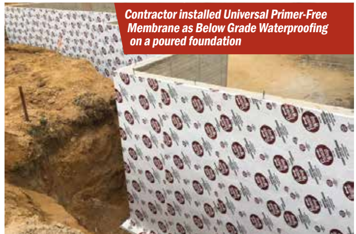
Contractor installed Universal Primer-Free Membrane as Below Grade Waterproofing on a poured foundation